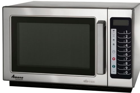
Model RCS10TS shown