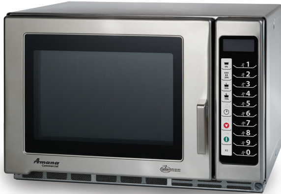
Model RFS12TS shown